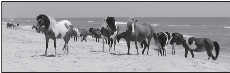
Text and photographs from "The Wild Horses of Assateague Island," National Park Service, US Department of the Interior

from "The Wild Horses of Assateague Island"